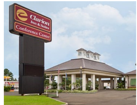
Clarion Inn & Conference Center 501 N Hwy 190 Covington, LA 70433

Reservations can be made by calling 985-893-3580 and select Option 2 . The Louisiana Mosquito Control Association group rate is $91.00 per night. All members must reference the room block code “Louisiana Mosquito Abatement” to get the conference rate. The room block cutoff date is November 13, 2017. Guest may cancel reservations up to 24 hours prior to arrival without penalty.